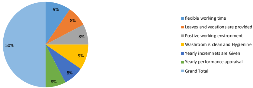
Sum of Non Teaching Staff